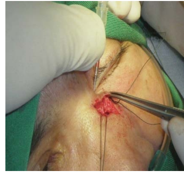
Picture 5. Tunnel made inferomedially

Measurement of the distance from the lacrimal caruncula to the osteotomy site was done which revealed 13 mm. This measurement was to determine the length of the tube to be implanted. A small incision was done at lacrimal caruncula using a blade 11 then a tunnel was made using a gauge