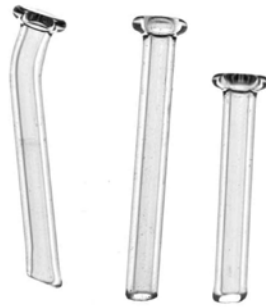
Picture8. Standard Lester Jones tube

14 gauge angiocatheter and then tube is inserted under direct endoscopic visualization. 10