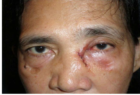
Picture 7. One day post operatively with no epiphora, OS

Patient was advised to sniff and blow lightly through the nose during the first few weeks. If patients anticipate coughing, sneezing or must blow their nose, they should close their eyelids tightly and place a finger over the tube at the medial canthus (over the end of the tube) to prevent dislocation. The patient should be warned to avoid straining or vigorous exercise for 10-14 days post operative to decrease edema and the possibility of nasal bleeding. During follow up, irrigation with saline via an irrigating syringe or regular syringe attached to a piece of tubing was done to prevent mucus accumulation. 6,7 Patency of flow post operative was evaluated by demonstrating aspiration of fluorescein dye under the slitlamp. If the tube was dislocated or expelled, the patient was advised to seek consultation immediately. The tube was inspected every month for 6 months and at the time of examination patient does not experience any epiphora.