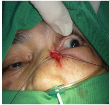
Picture 4. Osteotomy site exposed