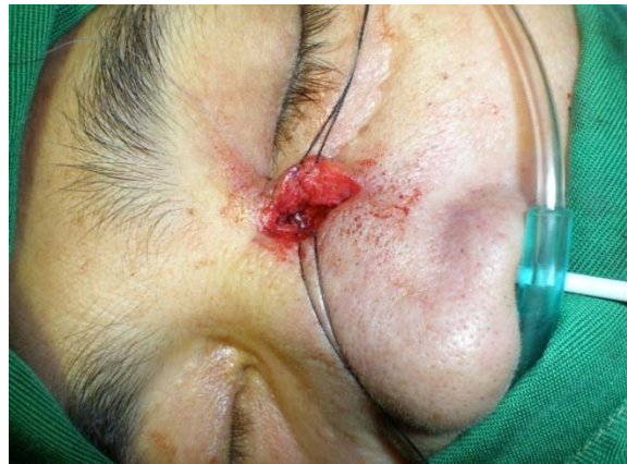
Picture 6. Jones tube implanted

19 needle inferomedially towards the osteotomy, and dilated using gold dilators (Picture 5). The 13-mm standard pyrex tube then implanted (Picture 6) and fixated at the caruncula using prolene 8-0 which will be removed after 4-6 weeks.