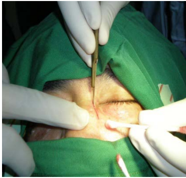
Picture 3. Skin incision created

of previous osteotomy and a fibrotic flap on osteotomy site was removed using a blade 11.